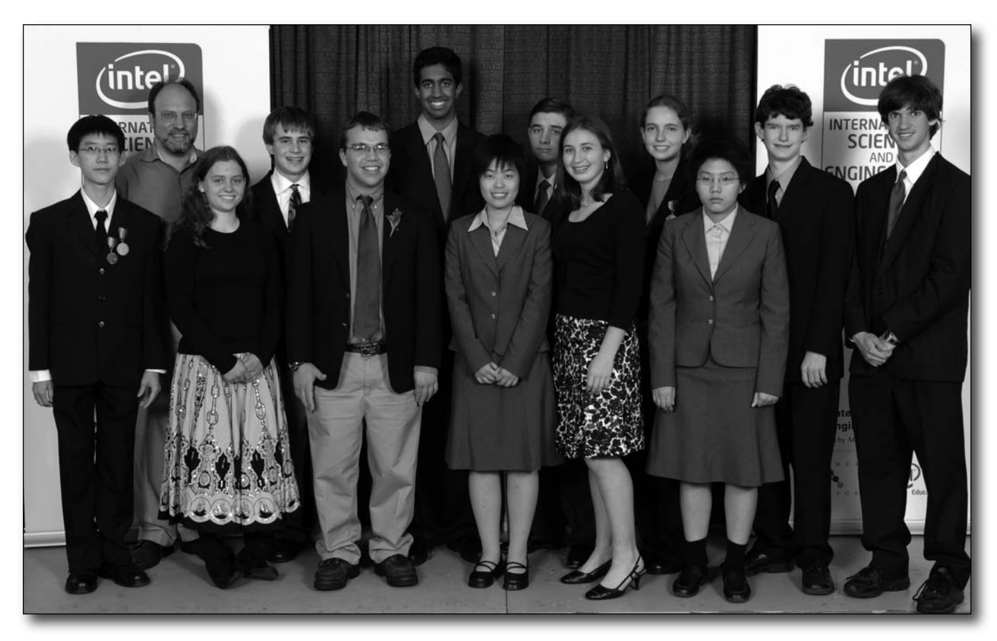
AAAI 2006 Special Awards Program Winners at the Annual Intel International Science and Engineering Fair (ISEF).