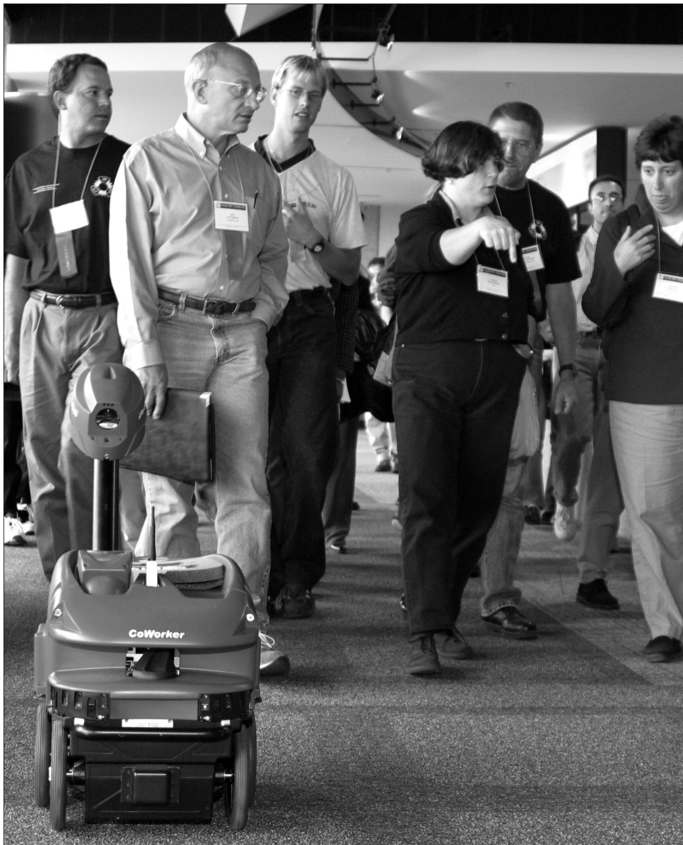
Figure 1. IRobot: CoWorker in Edmonton Alberta's Shaw Conference Centre, AAAI-02.