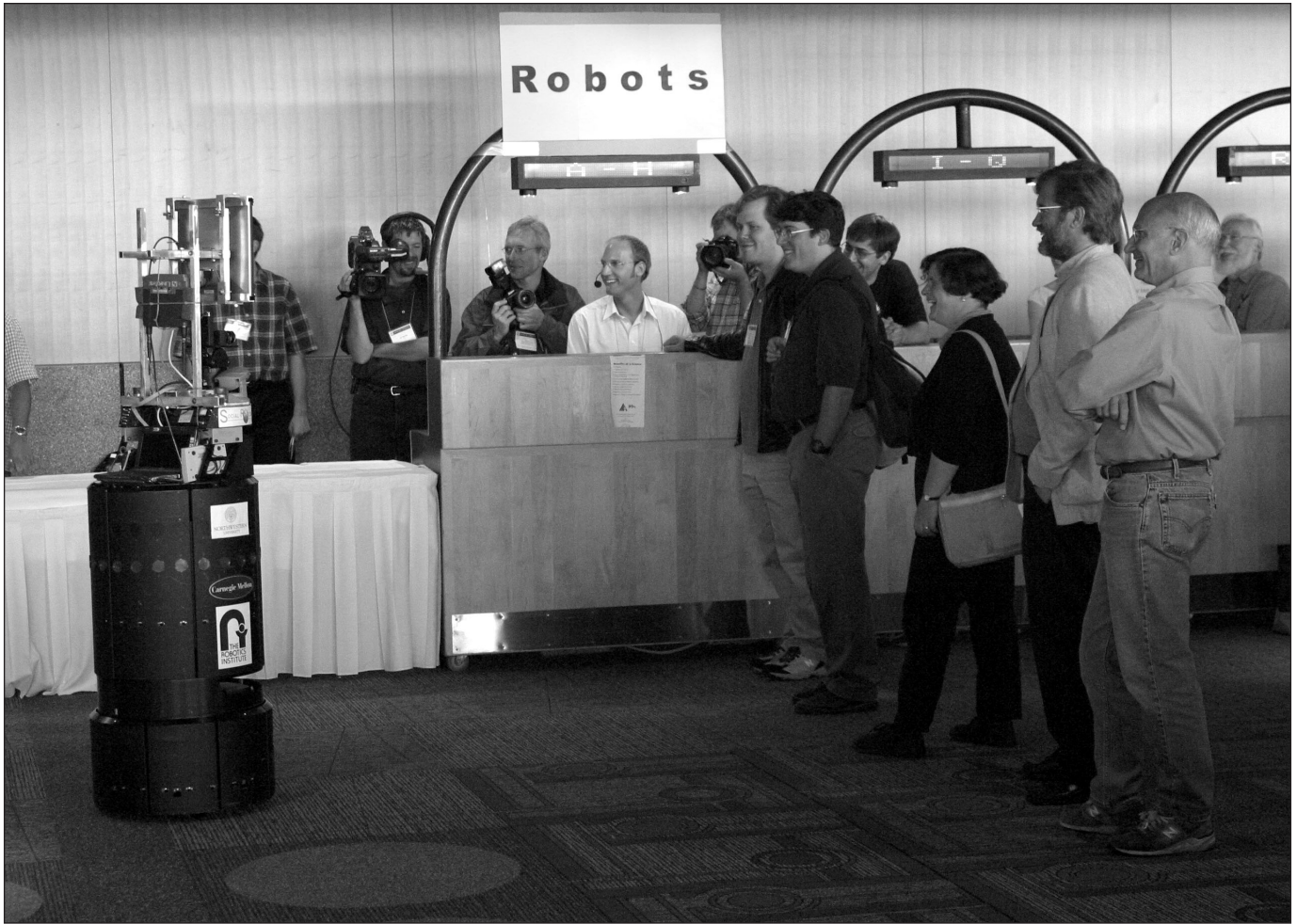
Figure 3. GRACE Approaching the AAAI-02 Registration Desk.

the judges were told that the language understanding component worked correctly, once the speech input had been captured. Unfortunately, the failure of the front end made the language understanding difficult to see. Two gesture-recognition methods were planned, one using vision and one using Palm Pilot input, but neither was in working order during the Challenge itself, so they were not successfully demonstrated.