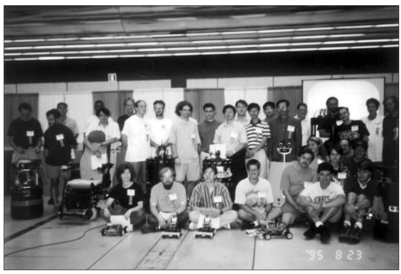
The 1996 Robot Teams.

humans over the course of this experiment, the researchers were extremely pleased with the results.