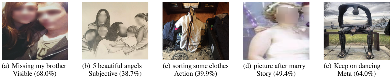
Figure 4: Example text-image posts and their distribution of (a) visible, (b) subjective, (c) action, (d) story, and (e) meta text-image semantic relation in Reddit r/GriefSupport. We omit text non-related to the relation and blur sensitive content in the image for copyright and privacy concerns.

the MLP classifier with the adam solver performs the best for predicting the amount of emotional (0.802) and network support (0.659). We then use these best classifiers to predict the amount of four types of social support in the remaining 37100 comments in our dataset. One annotator manually cross-verifies a random sample of 100 comments from this machine-labeled dataset. The classifiers achieve an accuracy of 71% / 77% / 63% / 65% for predicting informational / emotional / network / esteem support, which is comparable to the model performances in previous work on social support (Sharma and De Choudhury 2018).