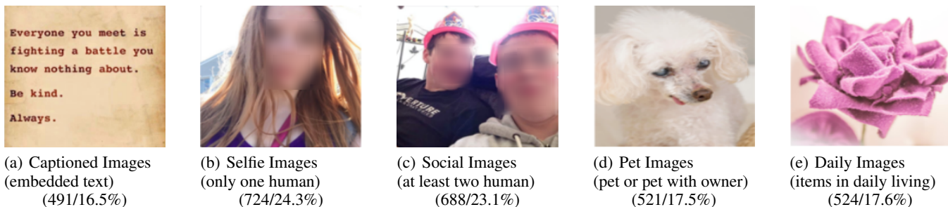
Figure 2: Example images for five image themes and their occurrences/distributions in our dataset of text-image posts in Reddit r/GriefSupport. We decrease the resolution and obscure sensitive information of the images for copyright and privacy concerns.