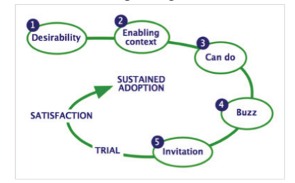
Fig 3. Five-Doors Theory adapted from Robinson (2015)

Our assumption is that, by analysing these five conditions, we create an opportunity for users to acquire knowledge on the problem and possible solutions, to feel empowered to act, to invite other people and, hopefully, to sustain more pro-environmental behaviour. To perform this analysis, we associate types of tasks and features of the Climate Challenge as conditions in the 5-Doors model, and analyse how current users are grouped in this behaviour change process. We expect to identify aspects of the game that should be considered to boost this process.