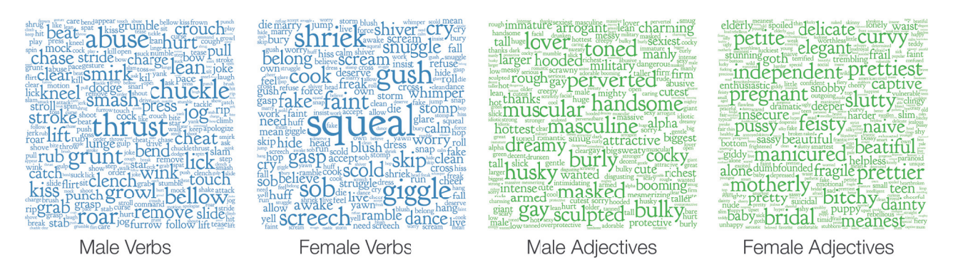
Figure 1: Here we present verbs and adjectives that are significantly associated ( p < 2.5e^{-5} ) with male and female characters. The size of each word in the cloud is proportional to its odds ratio for the associated gender.