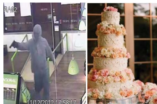
Figure 2: Images from Pinterest collections by a Police department and an image uploaded to a wedding pinboard.

Pinterest is evolving as people construct collections. Our interviews and observations of activity on the site suggest there exists an implicit agreement about what is and what is not appropriate for pinning. Use of Pinterest provided tools like a “Pin It” sharing button on design blogs and e-commerce product pages promote pinning of images from these sites. Yet, this agreement may be unraveling, or at least undergoing substantial changes. There is a growing presence of people on the site who build repositories for purposes other than showcasing beautiful and visually interesting imagery. For example, the Philadelphia Police department posts mug shots and surveillance video of suspected criminals and crimes to support police work. Like-