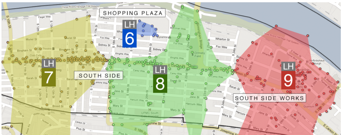
Figure 2: The municipal borders (in black) and Livehoods for South Side.

they go to for entertainment, where they go for food, where they go because they enjoy the walk.