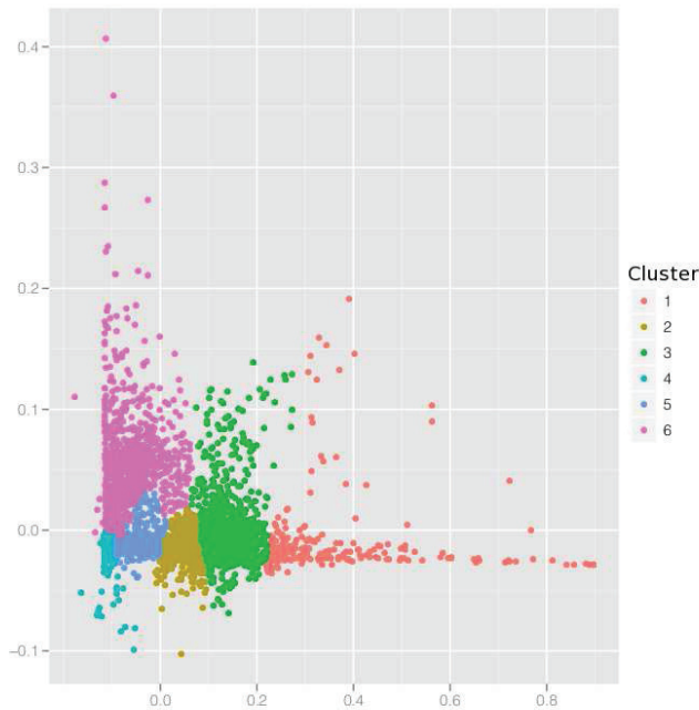
Figure 2: MDS with clusters