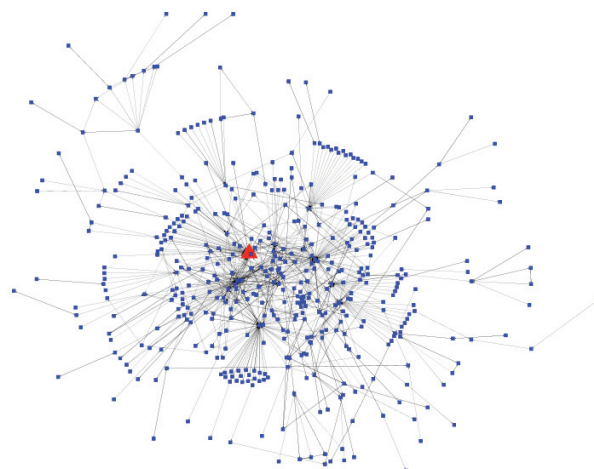
Figure 3: network of followers. The triangle is the original source.

increase information access, but also aggregate timing and referrals values. Retweets have specific benefits, related to how users perceive them and their roles in Twitter. Thus, we will analyze the results on the prism of these benefits: referrals, information access and timing.