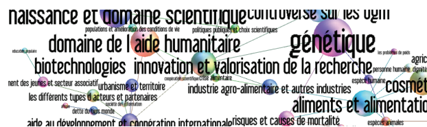
Figure 1: Label Adjust algorithm avoid label overlapping

ize, spatialize, filter, manipulate and export all types of networks. The visualization module uses a special 3D render engine to render graphs in real-time. This technique uses the computer graphic card, as video games do, and leaves the CPU free for other computing. It can deal with large network (i.e. over 20,000 nodes) and, because it is built on a multi-task model, it takes advantage of multi-core processors. Node design can be personalized, instead of a classical shape it can be a texture, a panel or a photo. Highly configurable layout algorithms can be run in real-time on the graph window. For instance speed, gravity, repulsion, auto-stabilize, inertia or size-adjust are real-time settings of the Force Atlas algorithm, a special force-directed algorithm developed by our team. Several algorithms can be run in the same time, in separate workspaces without blocking the user interface. The text module can show labels on the visualization window from any data attribute associated to nodes. A special algorithm named Label Adjust can be run to avoid label overlapping (Figure 1).