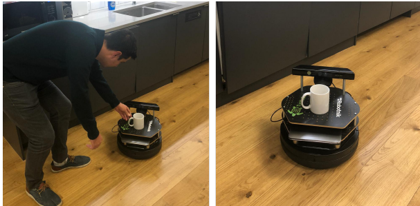
Figure 3: The Turtlebot 2 platform used in the second experiment to perform delivery tasks.