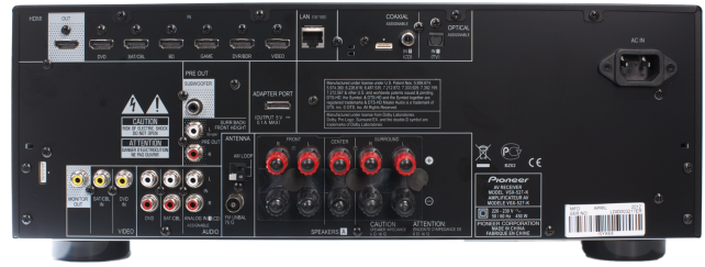
Figure 2: The figure shows the back panel of the amplifier used in our domain model and user study.

Once a dialog goal is finished, its effects are sent to the Knowledge Base component (arrow 9). A common pattern is to associate a dialog goal to a plan step, and interpret the user's input as an acknowledgement of having achieved the effects of the plan step. The effects registered by the Interaction Management component are then combined with sensor inputs within the Knowledge Base component to calculate a belief about the current world state. This information is then passed back to the Plan Execution component (arrow 10). That component compares the believed state with the expected state, using the effects of the last plan step. If they match, the next plan step is executed in the same way. If a deviation from the expected state is detected, the Plan Execution component triggers the Plan Repair component (arrow 11). Repair is initiated by constructing an augmented planning problem , which incorporates the found discrepan-