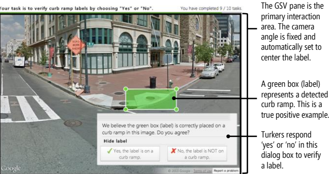
Figure 1: We explore initial approaches to scalably detect accessibility problems in GSV images by combining automated approaches

While we expect that computer vision and machine learning will provide multiple benefits including location triaging, view selection, and adaptive workflows, in this poster paper, we examine a single use case: automatically detecting accessibility features in GSV images with human verification. In our aforementioned past work, we found that labeling tasks were more time consuming than verification tasks. Thus, in our work here, crowd workers simply verify results from an automatic curb ramp detection algorithm rather than provide their own labels (Figure 1). Curb ramps were selected both because of their visual salience in images (a good starting point) as well as because of their significance to accessibility (e.g., see [3rd Circuit 1993]).