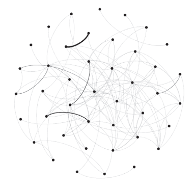
Figure 3: Collaboration graph between players. Nodes are players, edges show collaboration, and the thickness of the edge represents the duration of the collaboration.

rameter until the number of contrast motifs in each group is less than the c parameter.