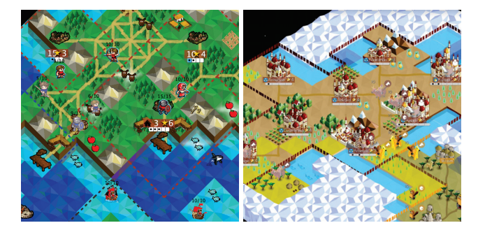
Figure 1: Tribes (left) and The Battle of Polytopia (right).

combat. Combining all of them requires effective decision making and enables different playing strategies. Managing the economy revolves around the accumulation of game currency (stars). These are produced by all the cities owned by the tribe and are awarded at the beginning of each turn. The collection of resources and construction of buildings adds population to cities, which then level up every time the population reaches a target (city level+1). Leveling up augments the star production of the city and provides bonuses to choose from (extra production, resources, city border growth, etc). If a city reaches level 5 or higher, a specially strong unit (a superunit, or Giant) can be spawned. Each tribe unlocks new features by spending stars to research up to 24 technologies in the tech tree, including the construction of new buildings, ability to gather new resources within the city borders or traverse water and mountain tiles.