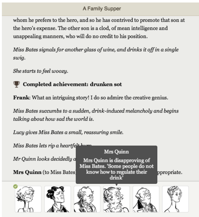
Figure 1: A screenshot of the Versu example game A Family Supper , taken from (Evans and Short 2014b). The story so far is laid out like a play script, and what each character is currently thinking about can be viewed by interacting with the character portraits at the bottom of the screen.

Our recreation of Praxis is called Praxish. Praxish is implemented in dependency-free vanilla JavaScript and can consequently be deployed in a wide variety of contexts, including frontend-only mobile and desktop web browser games, as well as in a standalone desktop executable or on the server side via Node.js. Additionally, Praxish is open source. 1 Like Praxis, Praxish is a relatively low-level language that will eventually serve as the compilation target for a higher-level and more approachable content authoring language akin to Versu's Prompter; however, it also implements a sufficiently full set of features that recognizably Versu-like storyworlds can be created in only the preliminary version of Praxish that exists today. (Figure 2 shows which Versu components have been recreated in Praxish in some form.)