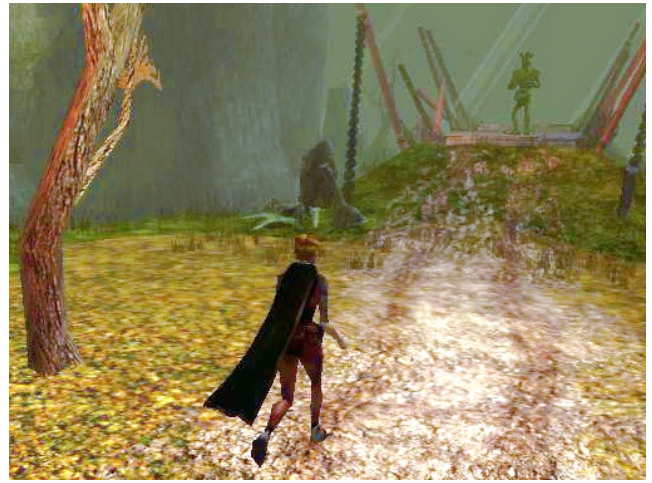
Figure 2: The troll awaiting the player on the bridge.

When the player enters a nearby forest in search of the potion ingredients, PaSSAGE’s Crossing the Threshold routine is called ( D_2 ). Again, two encounters are available, but given the player’s inclination towards being a Method Actor (M=141) and somewhat of a Power Gamer (P=61), an encounter is chosen wherein a troll blocks the player’s path, offering riches beyond imagination for helping to trap an evil wizard in the forest (Figure 2). The player agrees to go along with the dubious plot, and her modelled inclination towards the Method Actor and Storyteller types increase (F=1 M=181 S=81 T=1 P=61). The player continues through the forest while the troll hurries ahead to prepare the trap. Along the way, PaSSAGE’s Road of Trials function is called ( D_3 ) to choose an encounter to occur along the forest path. Given the player’s new inclination toward storytelling, the encounter chosen involves a wizard who seems suspiciously similar to a character that was prominent in the history lesson earlier in the day. The wizard asks the player a riddle, which she agrees to solve. The final scene begins with the wizard arriving outside of Jarnas’ house with the troll waiting inside. Instead of luring the wizard into the troll’s trap, the player warns him of the troll’s presence, and a battle between the troll and wizard ensues (Help troll: N, Warn wizard: Y). The wizard slays the troll, and the land is safe once again (WKT in the game tree).