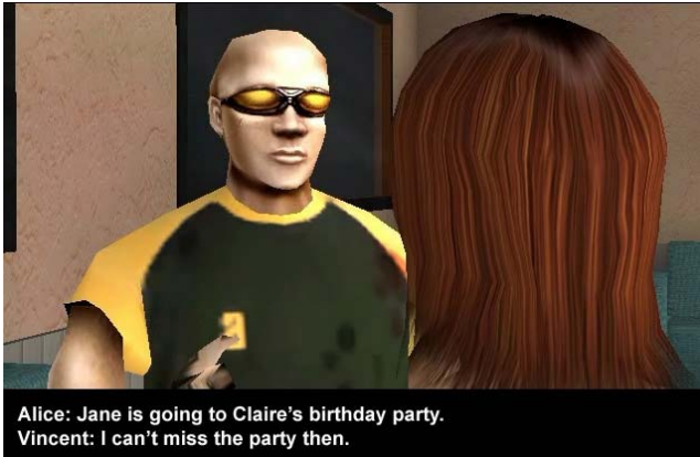
Figure 2: An invitation to a party.

considering Bremond's role of influencer (which is self-explanatory). A character wishing to influence another will use different rhetoric functions, such as advice, threats, seduction, for expressing that influence, depending on his understanding of the recipient's goals (Bremond 1970). To some extent, Bremond's proposal was the first one to attempt to properly map narrative functions to communicative acts. However, it did not address the conversational aspects of the characters' dialogue, nor did it specify the semantic content of corresponding utterances.