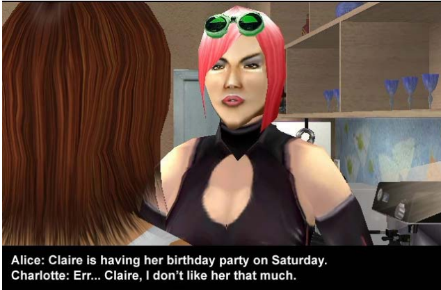
Figure 4: Turning down an invitation (implicit refusal, see text).

for instance: "I don't fancy parties" or "No-one likes Claire" where the event property is part of the contents of the request (constraint not represented here) (Figure 4).