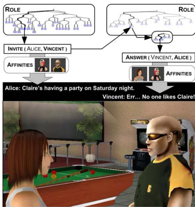
Figure 1: Characters’ roles and the influence of their affinities towards other characters.

Another approach taken in the MRE system consists in integrating strongly dialogue and narrative by resorting to a task-based dialogue (Traum et al. 2003), such a negotiation dialogue which naturally supports the mode of communication to be expected in taking decisions under critical conditions.