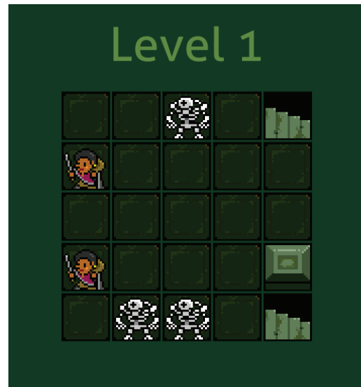
Figure 1: A screenshot of a level from Before Venturing Forth . Art by Oryx.

Copyright © 2017, Association for the Advancement of Artificial Intelligence (www.aaai.org). All rights reserved.