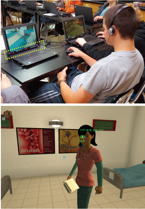
Figure 3: (Top) Students’ gameplay. The yellow dashed box is the Tobii EyeX eye tracker used to capture player gaze traces. (Bottom) Gaze label indicated with green eye icon. The game logs the gaze target’s name in the game trace data. This screenshot was captured for demonstration purposes. Gaze labels are not displayed during gameplay.

need for extensive feature engineering with coordinate-based eye gaze data.