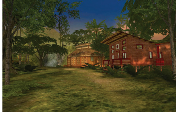
Figure 1: The CRYSTAL ISLAND open-world educational game.

Deep learning (LeCun, Bengio, and Hinton 2015) has shown particular success in player modeling. Summerville and colleagues (2016) investigated procedural content generation using LSTMs that learn latent play styles from