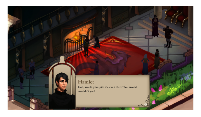
Figure 2: Elsinore : Example of the player witnessing an event in Elsinore .

Elsinore <sup>2</sup> is a time-looping adventure game set in the world of William Shakespeare's Hamlet . Players take on the role of Ophelia, navigating their way through Castle Elsinore and observing the events of the tragedy unfold in real-time. Throughout the drama, Ophelia can acquire and present pieces of knowledge (called hearsay in-game) to the other characters, influencing their beliefs and desires, changing the events that take place, and thus significantly affecting the final outcome. Ophelia is trapped in a time loop, repeating the events of the play over and over.