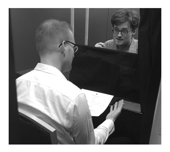
Figure 5: Bad News : A player, left, engages in embodied conversation with the actor, who improvisationally performs as a resident of the town.

county demands his presence. Being occupied in this way, the mortician is forced to delegate this important task to his newly appointed assistant, the player. To carry out the task, the player must navigate the town and converse with its residents in order to obtain three crucial pieces of information, each of which can only be discovered by knowing the preceding piece: the identity of the deceased, given only the person's physical appearance and home; the identity of the next of kin, given the identity of the deceased and an explicit notion of a next of kin (that we provide); and the current location of the next of kin, given his or her identity and any other relevant information that the player has gathered. Finally, upon locating the next of kin, the player must notify him or her of the death. Throughout, she should remain discreet, so as to respect the privacy of the family.