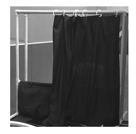
Figure 6: Bad News : A constructed model theatre separates the player and our live actor.

From here, the player proceeds by speaking commands