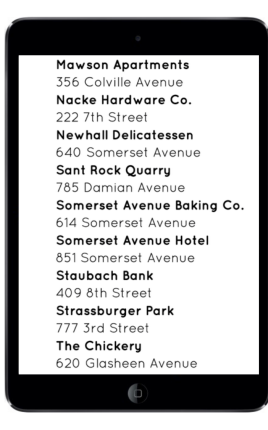
Figure 7: Bad News : Excerpt from a business directory for a procedurally generated town, as displayed on the player interface.