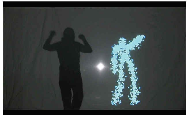
Figure 1: A human interactor and VAI co-creating a movement-based proto-narrative in a liminal virtual / real projected plane.

The Viewpoints AI system has been created as an exploratory AI / art research platform for understanding how