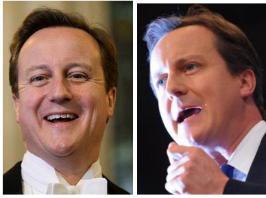
Figure 1: Two images of the British Prime Minister. Left: augmented with ‘happy’. Right: augmented with ‘angry’.

inspired by a collage-generator described in (Krzeczkowska et al. 2010) that created image mashups using current news stories. ANGELINA 3 reads the current top five news headlines, and ranks them as follows. Articles which feature tags ANGELINA 3 has no record of seeing before are considered more interesting, but the system will also use a sentiment analysis technique to query Twitter about people whose names it has heard of before. If ANGELINA 3 detects a shift in opinion about a person, that raises how interesting an article is, as described below.