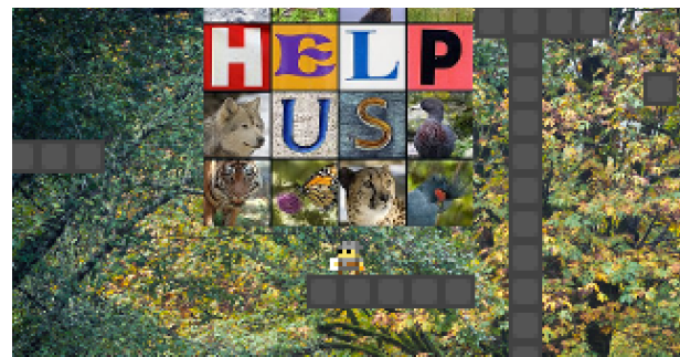
Figure 4: A screenshot from The Conservation of Emily , named after the 1964 film The Americanization of Emily .

Child Protection, Children and Social Care , and created a game called Sex, Lies and Rape . It can be played online at http://www.gamesbyangelina.org/aide/slar .