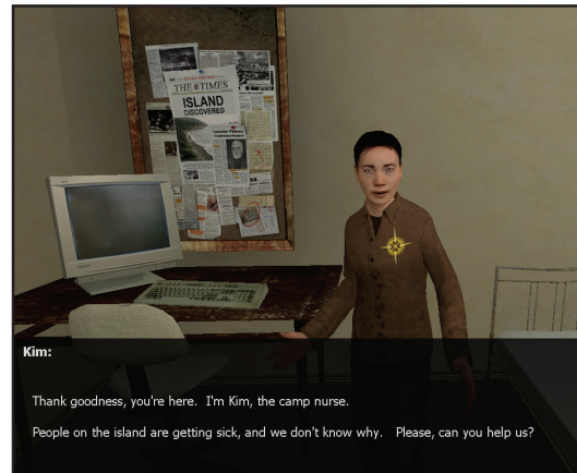
Figure 2. CRYSTAL ISLAND narrative environment.

The dynamic Bayesian network for knowledge tracing has been implemented in C++ using the SMILE Bayesian modeling and inference library developed by the University of Pittsburgh's Decision Systems Laboratory (Druzdzel, 1999). The model maintains approximately 135