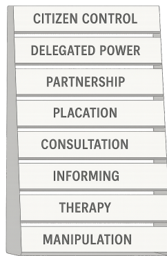
Figure 3: Arnstein’s ladder of citizen participation. A visual framework showing eight levels of citizen involvement, from nonparticipation to full citizen control in decision-making.

tion and community-based planning but requires patience, open-mindedness, and often, neutral facilitation to navigate differing viewpoints (Chambers et al. 2022).