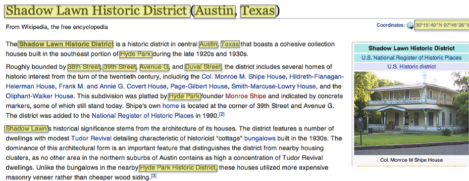
Figure 1: Wikipedia page for Shadow Lawn Historic District in Austin, Texas. Place Names and coordinates are highlighted.

graphic clustering techniques in the context of text-based geographic disambiguation. Cheng, Caverlee, and Lee (2010) derive information analogous to local geographic clusters for words to geo-reference Twitter users. Following work by (Backstrom et al. 2008) on determining the geographic focus of queries, they identify a subset of words with a prominent geographic center (characterized by large probability of the word occurring at a location) and steep decay of the probability over distance from that center. This approach does find many geographically indicative words, but it makes assumptions about their distributions that are not ideal for toponym resolution. In particular, they assume that geographic words have well-defined centers and highly peaked distributions. Many toponyms—which intuitively should be the most helpful words for geographic disambiguation—lack such distributions. Instead, many toponyms are widely dispersed over distance (e.g. toponyms that describe large geographic spaces like countries lack steeply peaked centers) or have multiple prominent geographic centers. Figure 2 gives an example of how the toponym Washington is characterized via multiple prominent geographic clusters.