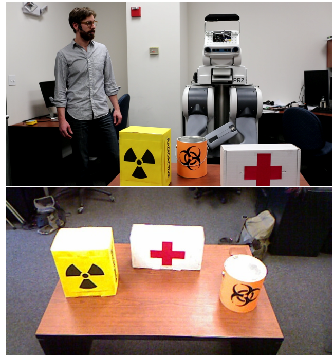
Figure 2: A human instructor teaching the robot what a “medkit” is (top); a typical instruction scene viewed from robot’s mounted Kinect sensor (bottom).

H: Do you see a medkit? R: What does a medkit looks like?