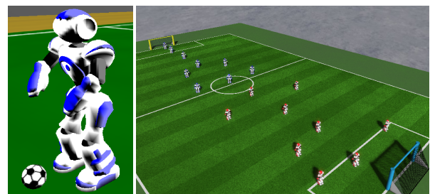
Figure 1: A screenshot of the Nao humanoid robot (left), and a view of the soccer field during a 9 versus 9 game (right).

We now describe the mathematical formulas that calculate the positions of the feet with respect to the torso. More than 40 parameters were used but only the most important ones