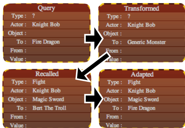
Figure 1. TRAM system in action

The first step for each query is to attempt to recall fragments out of the story library which match without any transformation. Failing this, TRAMs have transformations that they apply to the query before recursing. Effectively, the TRAM system searches through a space of TRAM applications to find a linear sequence of TRAMs which lead to a query that directly matches a story fragment in the library. When a result is found, each TRAM in the recursive stack applies its own adaptation code, transforming the result into a form applicable to the original query. The benefit of this method is that it can use precise transformations and adaptations in sequence to effectively find cases that are quite different from the original query. Of course, the TRAMs are not perfect, and the more TRAMs used, the higher the risk of a result which is incoherent with the rest of the story. Thus the TRAM system relies on a story library which contains examples that are fairly close to the queries it attempts to answer.