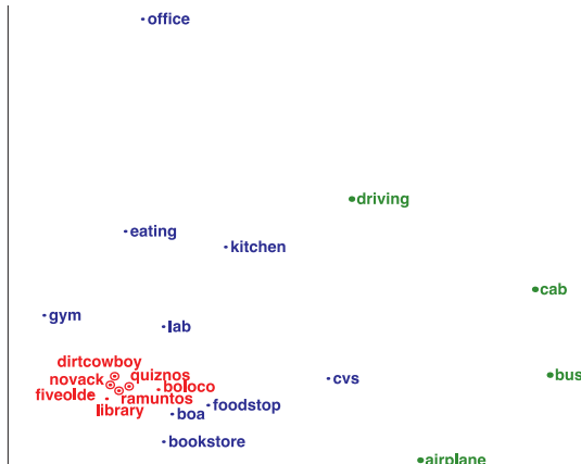
Figure 3: Multidimensional Scaling results for similarity between classes. MDS axes have no meaningful units.

boosted decision stump classifier. If classes A and B get merged in the previous step, we construct a classifier C_{AB} in the following manner: