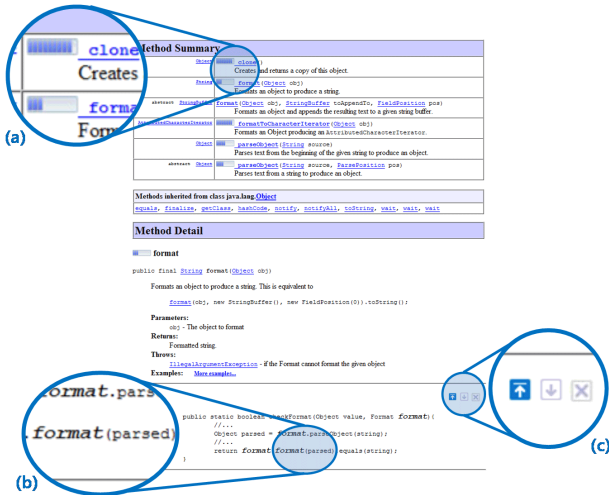
Figure 2: An example page of generated eXoaDocs. (a) The popularity information of methods (b) Code examples (c) User’s feedback button

Figure 2 (a), to help developers’ browsing needs to find APIs that are used frequently in programming tasks. For each API, two to five code examples are presented, as Figure 2(b) shows. From this point on, we call these documents example oriented API Documents (eXoaDocs) .