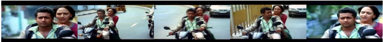
LSTM : a man is riding a motorcycle FCVC-CF&IA : a man and woman are riding a motorcycle