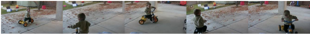
LSTM : a little boy is playing with a toy FCVC-CF&IA : a boy is riding a bicycle