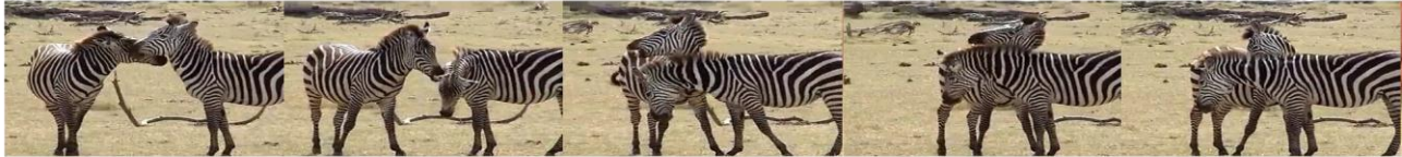
LSTM : a man is playing with a man FCVC-CF&IA : two zebras are playing