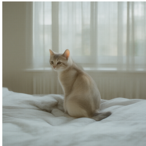
(b) Euler (Baseline)