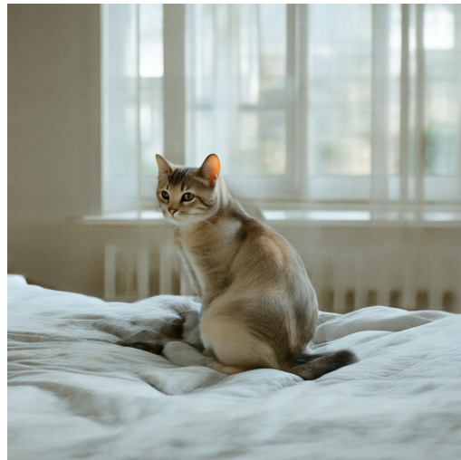
(a) A-Euler (Ours)

Flow Path Reparameterization without Adaptive Mechanism. To isolate the contribution of flow-path reparameterization, we remove the adaptive mechanism while retaining the flow-transformed velocity field. As shown in Table 2, this non-adaptive variant (FloPS) almost consistently surpasses DDIM across all NFEs, demonstrating that reparameterizing the sampling trajectory alone yields a more sample-efficient process and achieves better alignment with