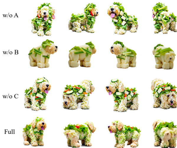
Figure 4: Qualitative results of the ablation study, illustrating the impact of each key module. The prompt used here is “a DSLR photo of a dog made out of salad”.

Timestep Sampling, and C as Hybrid Orthogonal Gradient Fusion for ease of exposition. Specifically, w/o A replaces the adaptive sampling strategy with uniform random region sampling; w/o B uses random timesteps instead of our hybrid adaptive approach; and w/o C updates the model using only single-view gradients without performing any fusion.