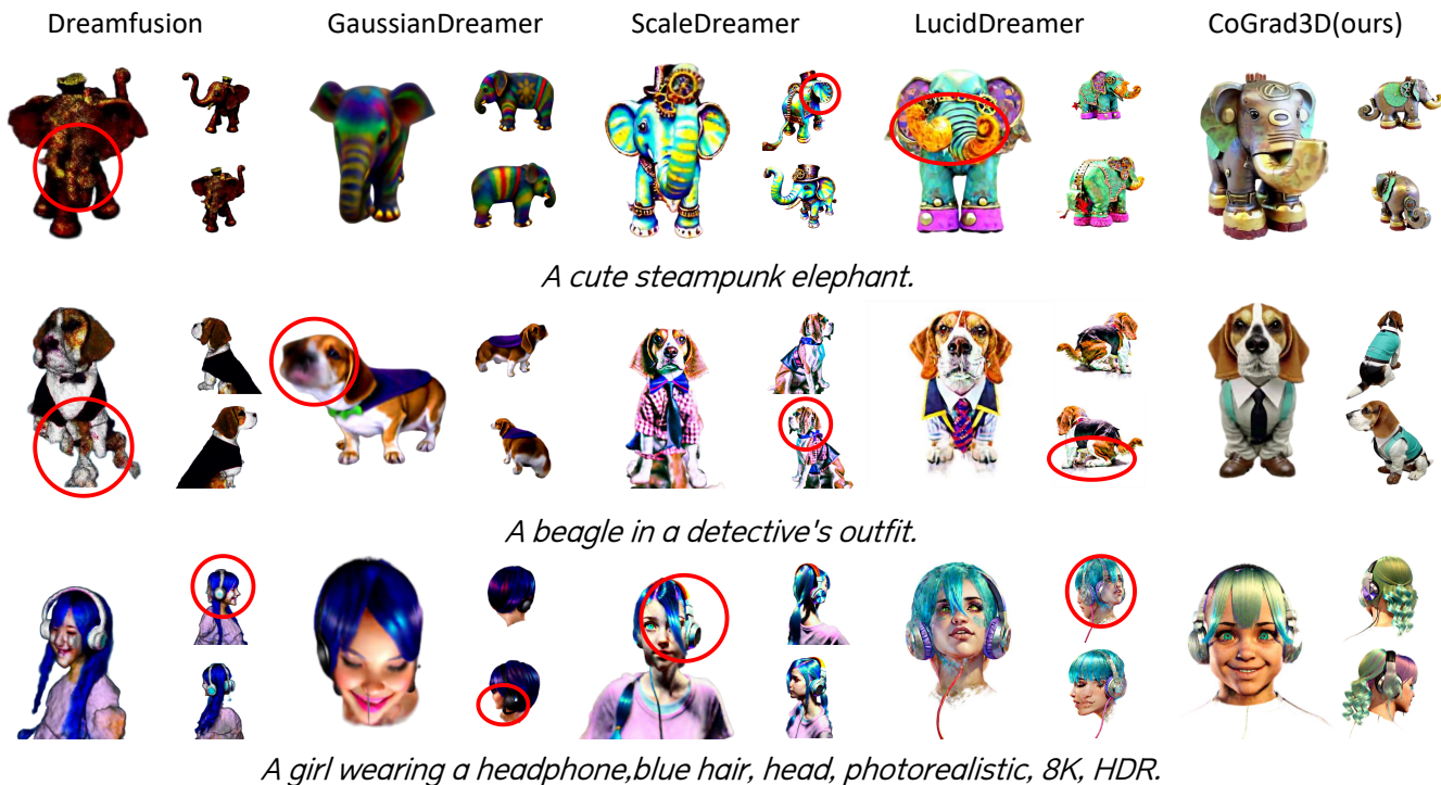
Figure 3: Qualitative comparison between CoGrad3D (Ours) and baseline methods on representative text prompts. Artifacts or inconsistencies are marked with red circles.

to judge the aesthetic quality. To evaluate 3D consistency, we measure the Janus Problem Rate (JR), which quantifies the frequency of multi-faced or other spatially inconsistent generations.