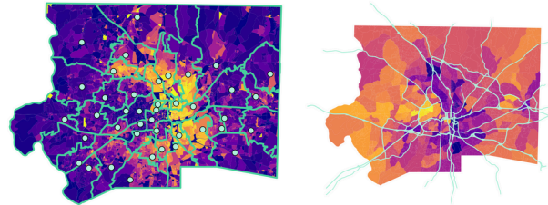
Figure 1: Maps of WS/FCS. Left shows race/ethnicity (computed via (Kenny 2022))—lighter yellow means higher proportion Black/Hispanic); right shows the distribution of the continuous, geographically-defined Socio-Economic Status (SES) index measure values (described more in Section 4—darker purple means lower SES).

The research partner for this study is Winston-Salem/Forsyth County Schools (WS/FCS), a public school district serving students from pre-kindergarten to twelfth grade in North Carolina. With more than 50,000 students, WS/FCS is the 4th largest school district in North Carolina and the 81st largest in the United States. WS/FCS students are racially diverse, with approximately 33% White students, 30% Black students, 30% Hispanic students, 6% reporting multiple races, and 3% Asian students. The district operates 81 schools (42 elementary). Despite district-wide diversity, residential and school enrollment patterns are still highly segregated. Figure 1 visualizes this segregation, highlighting patterns that make WS/FCS one of the most segregated districts in the state. As a recent recipient of a US Department of Education's "Fostering Diverse Schools" grant (Jacobson 2023), there is renewed interest in WS/FCS to explore how boundary changes might enhance SES diversity in schools. These would be the first significant changes to district boundaries since the end of court-ordered desegregation in the 1990s (Garms and Starke 2023). This paper names the district collaborator (with their permission) to ground the empirical explorations and findings in relevant historical and present-day context and inform more thoughtful applications of AI for social impact.