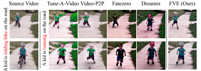
Figure 3: Qualitative comparisons. The first and last frames of the video are presented.

As shown in Table 6, previous methods either fail to maintain the video structure (TAV, Video-P2P) or show inferiority in cross-modal relevance (Dreamix, Fatezero), FVE demonstrates the best result with the harmonic score that combines the impact of both metrics. We present the qualitative evaluation of a single video due to space limitations. As depicted in Fig. 3, FVE generates videos that adeptly preserve instance appearance and generalise to new actions. More visualisations are presented in the Supplementary.