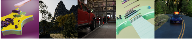
Figure 1: Sample images from each scene in the QuickRender dataset

versity between each set of image triplets while maintaining realistic motion of objects, lighting effects, and surface textures. Rather than taking multiple samples of the same video, QuickRender uses a new random seed to generate each triplet to increase diversity.