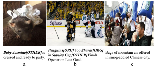
Figure 1: The samples for MNER task, where the named entities and their types are highlighted. a: fully relevant (explicit support information), b: partially relevant (implicit support information), c: entity irrelevant (no entities, no support).

In recent years, social media platforms like Twitter and Facebook have made great development, and they provide important sources (i.e., tweets) for various applications such as the identification of cyber-attacks or natural disasters, analyzing public opinion, and mining disease outbreaks (Bruns and Liang 2012; Ritter et al. 2015). Named entity recognition, the task of detecting and classifying named entities from unstructured free-form text, is a crucial step to extract the structured information for those downstream applications (Perera et al. 2018; Dionísio et al. 2019). With tweets tending to be multimodal and traditional unimodal NER methods having challenges to understand these multimedia contents perfectly, multimodal named entity recognition (MNER) has become a new direction and it improves conventional text-based NER by considering images as additional inputs (Lu et al. 2018; Yu et al. 2020; Sun et al. 2021; Chen et al. 2022b). For example, as shown in Figure 1(a), the supplement of visual information can alleviate the semantic ambiguity and inadequacy problem caused by only text in-