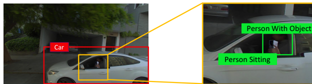
Figure 1: Left: A scene from Pandaset where only one cuboid label is provided for the bounding box. Right: The same scene is augmented by CLUE-AD with additional labels for the unobserved objects within the nested bounding box.

Copyright © 2023, Association for the Advancement of Artificial Intelligence (www.aaai.org). All rights reserved.