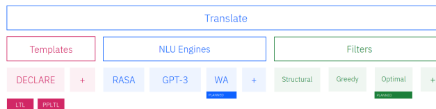
Figure 1: NL2LTL components

While allowing for a declarative design paradigm, LTL also has a secondary benefit: LTL formulas can be readily described in an easy-to-understand natural language format. For example, DECLARE templates (Pesic and Van der Aalst 2006) – a very popular specification language in the