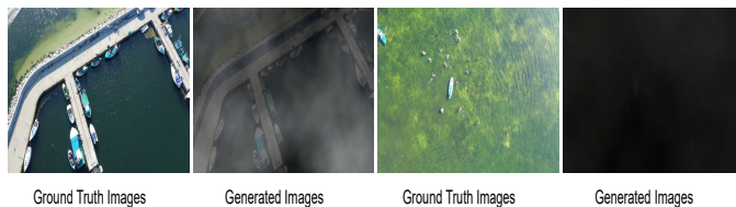
Figure 2: Example images of the generated dataset.

tested. Clearly, our network gives better results than previous works.