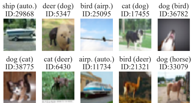
Figure 3: Some mislabeled or indistinguishable examples in the training set of CIFAR-10 found by Robust LR. The wrong annotations, the predicted classes (in the parentheses), and the IDs of images are shown. The airp. and auto. are airplane and automobile for short.