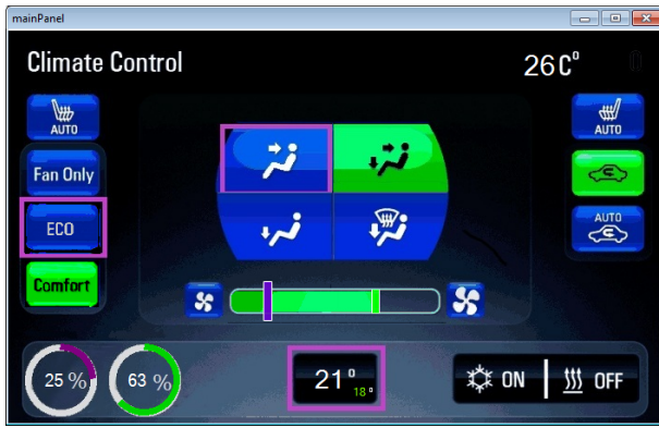
Figure 2: A screen-shot of the GUI accompanied with CARE’s advice. In this example, the driver set the temperature to 18°C (rather than 21°C as advised by CARE), the fan to 4 (rather than 1 - as shown by the purple line), the air delivery to both face and feet (rather than face-only) and the mode to “comfort” (rather than “eco”). This resulted in an energy consumption level of 63% of the maximal energy consumption level (right green circle), rather than only 25% if the driver would have followed CARE’s advice (left purple circle).

Therefore, in order to control this variance, we chose an experimental design that examined the effect of advice as a within-subject variable rather than a between-subject variable. We had each subject run the experiment twice, once with no advice (the control group) and once with advice given either from CARE or from CAREless. We counter-balanced the order among the type of experiments, i.e. approximately half of the subjects first ran the experiment with no advice, while the other half first ran the experiment with advice. Within each of these groups, approximately half of the subjects received CARE while half received CAREless.