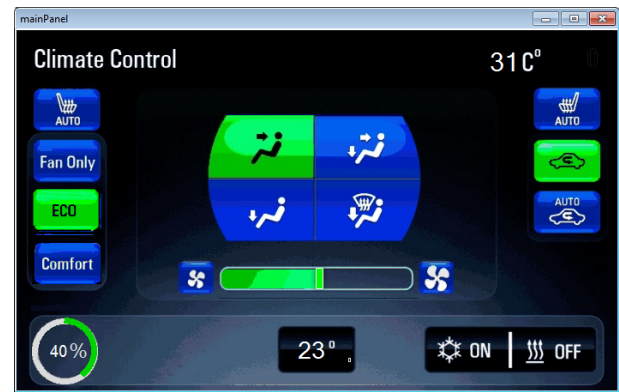
Figure 1: A screen-shot with additional energy consumption information provided by CAREless (the circle in the bottom left corner).