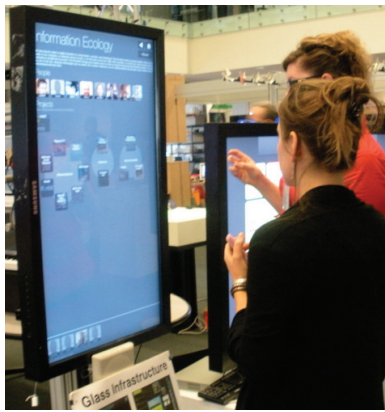
Figure 1: A student shares their work with a Media Lab sponsor using the Glass Infrastructure.

what we see (Egeth and Yantis 1997). When we explore artifacts in physical space, our interests make relevant properties of those artifacts seem more salient, and this makes navigating the space more manageable. In the flat world of the GI, where small images are substituted for the artifacts themselves, there is much less information to guide user salience. Therefore, we explicitly introduced a means to call attention to artifacts related to users' expressed interests, called "charms". Users can charm artifacts they're interested in, and these charms persist across time (users wear RFID badges that identify them to each screen, and allow their charms to be saved and reloaded). In this way, charming an artifact is similar to bookmarking or favoriting. The key distinction is our ubiquitous use of charms throughout the interface to call attention to people, groups, ideas, and projects related to users' interests.