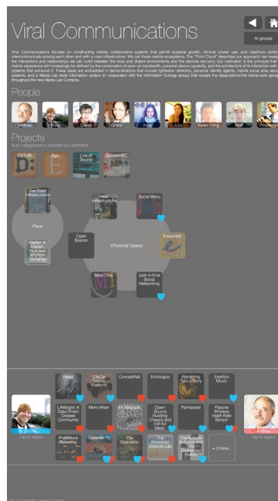
Figure 2: Two users logged into a screen. Image shows research group detail view with favorited projects indicated by heart shaped badges, in molecule configuration clustered by OCMS

She can then favorite projects she is interested in and these are stored in a personal profile she can access after the visit. Projects that are her favorites are demarcated with heart shaped badges.