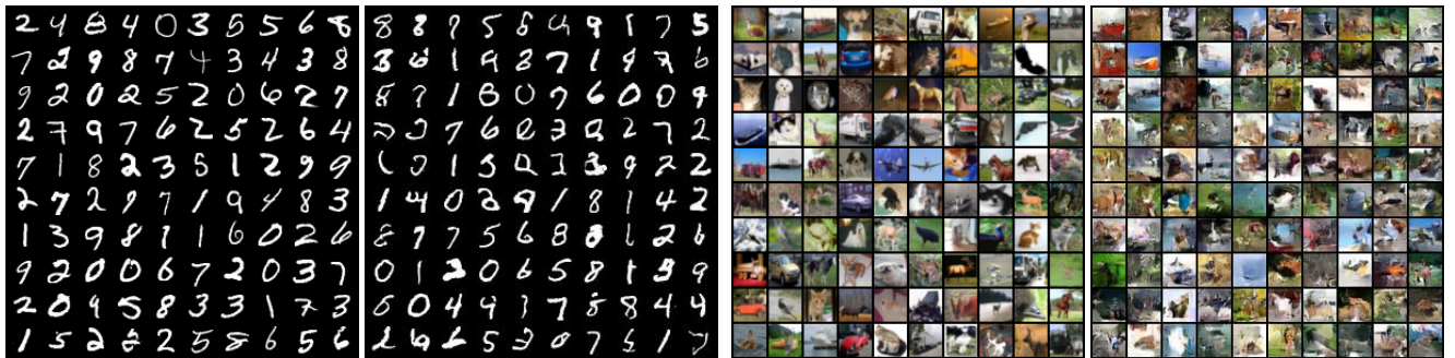
(a) Left: Ground truth images of MNIST data set. Right: Generated images by our model trained on MNIST data set. (b) Left: Ground truth images of CIFAR10 data set. Right: Generated images by our model trained on CIFAR10 data set..