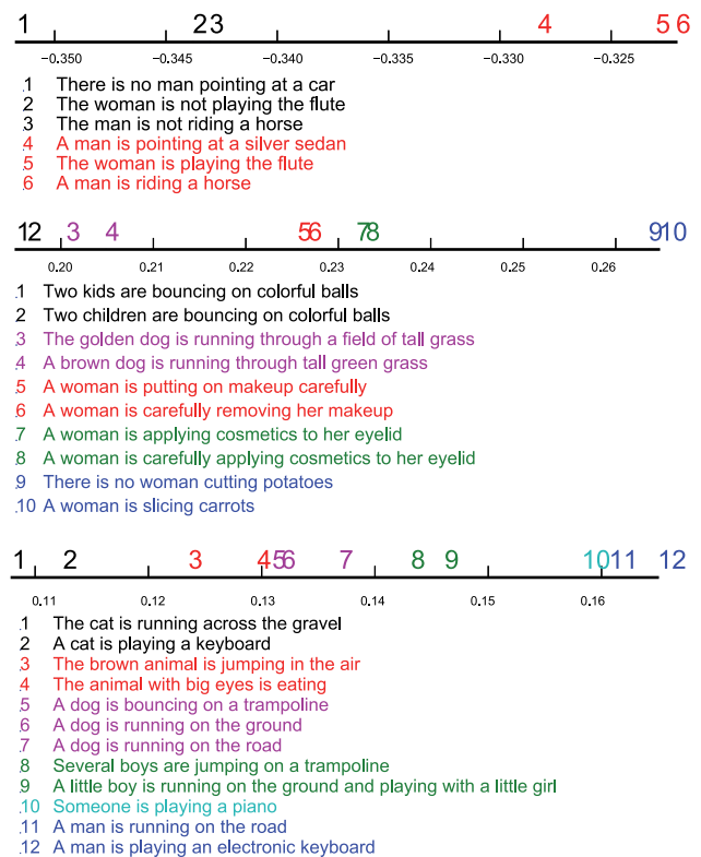
Figure 2: MaLSTM representations of test set sentences depicted along three different dimensions of h_T (indices 1, 2, and 6). Each number above the axis corresponds to a sentence representation and its location represents the value this particular hidden unit assigns to the sentence (shown below).

Next, we shift our attention from local characteristics of different hidden units toward the global geometry of the sentence representation space. Due to our training criterion, this space is naturally endowed with the \ell_1 metric and avoids being highly warped. While analysis of neural network representations typically requires nonlinear dimensionality re-