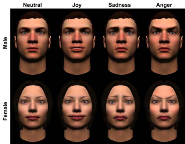
Fig.1 - Facial expressions of emotion.

expressions were validated by de Melo et al. (2014). Figure 2 shows the software implementation.