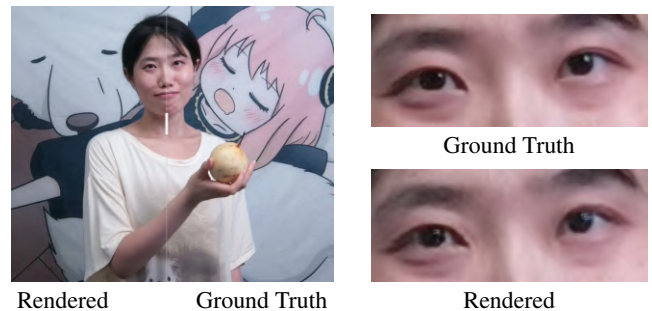
Figure 2: Comparison of rendered and ground truth image.

Using high-resolution point maps (Step 2) and 3DGS parameters (Step 3), Step 4 in Figure 1 renders novel-view images for the left and right eyes, specifically determined via eye-tracking (Step 5). The images are interlaced for 3D display, producing a binocular stereo effect, and the system supports motion parallax by dynamically updating views as the viewer’s gaze shifts. Running on the same GPU as the GPE module, the rendering stage adds only 3.3 ms, resulting in a total latency of 40.14 ms.