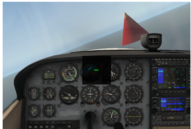
Figure 3: Green and blue bars show visual tutor feedback